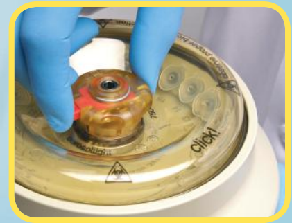
Transparent ClickSeal biocontainment lids