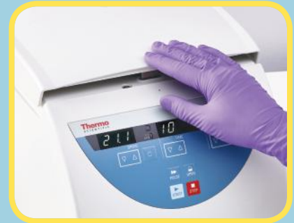
Fast one-click centrifuge lid closure