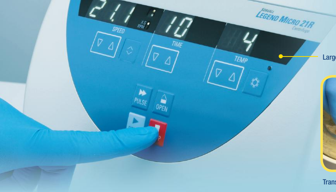
Large, bright and easy-to-read display