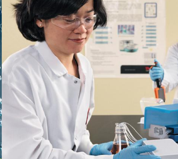
Thermo Scientific Multidrop Combi nL reagent dispenser