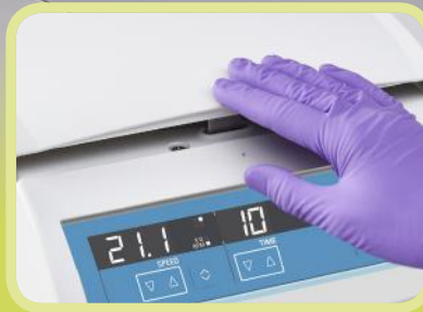
Fast one-click centrifuge lid closure