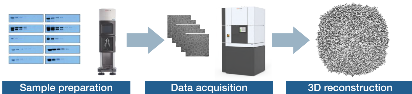
Figure 2. Schematic representation of the SPA workflow. After the biochemical steps of protein purification and verification, the samples are ready for cryo investigation. Cryo-grids are prepared using the Thermo Scientific Vitrobot™ System. Subsequently, they are transferred into the Glacios Cryo-TEM for sample optimization and high-resolution data acquisition followed by 3D reconstruction of the protein.

Falcon 4 is fully integrated with Thermo Fisher Scientific application software, such as EPU 2, which make daily operations easy and efficient.