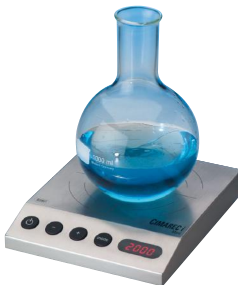
Cimarec i Maxi Direct Stirrer

Operating Conditions: -10° to +40°C at 95% RH. 100-240V units contain a cord set with various plugs.