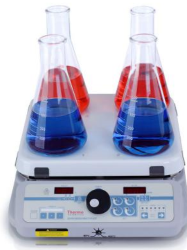
Super-Nuova Multi-Position Digital Stirrer

Certifications: cCSAus (all models), CE (220-240V models)