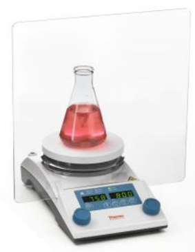
RT2 Digital Hotplate with transparent shield