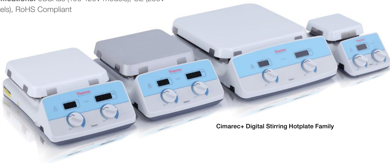
Cimarec+ Digital Stirring Hotplate Family

Certifications: cCSAus (100-120V models), CE (230V models), RoHS Compliant