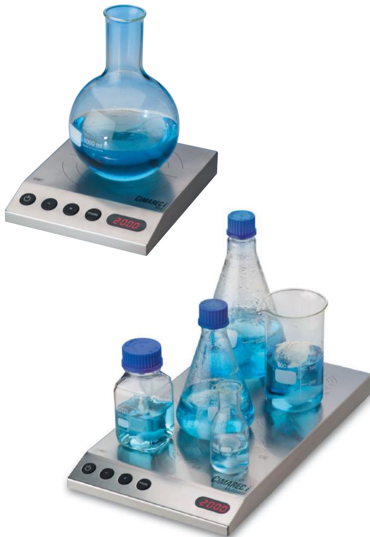
Cimarec i Magnetic Stirrers