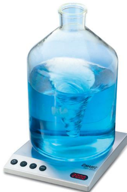
Cimarec Power Direct High Capacity Stirrer