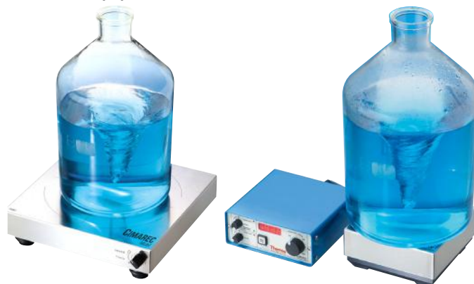
Cimarec Mobil Direct Stirrers