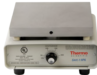
Explosion-Proof SAFE-T HP6 Hotplate

Includes: Stirrer unit and one 2 × 0.38 in. (5 × 1cm) PTFE-coated stir bar