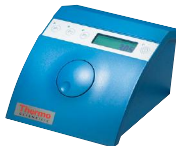
Cimarec i Teleomodul 40C and 20C Controller