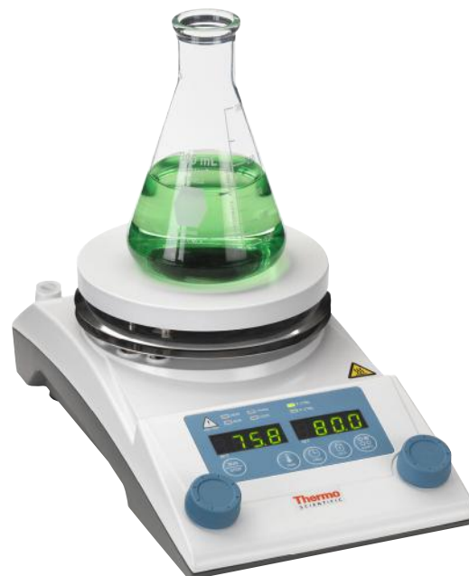
RT2 Digital Hotplate

Optional: Non-slip heating bath, transparent safety shield