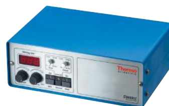
Cimarec 40B Telemodul Controller