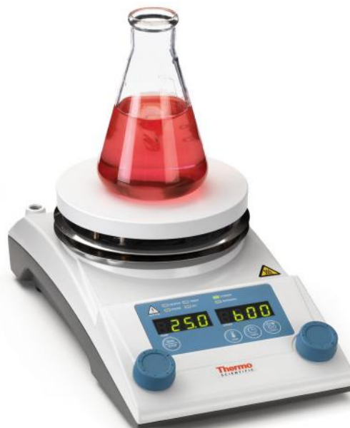
RT2 Advanced Hotplate Stirrer

Includes: Temperature probe (PT100, B Class)