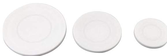
Non-slip silicone plate covers