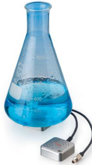
Cimarec i Micro Stirrer