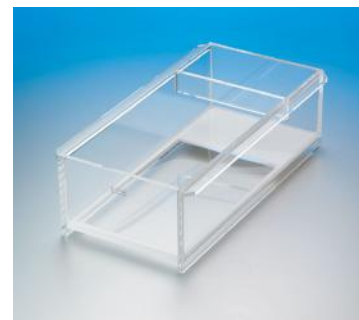
Cimarec i Bath Mounts