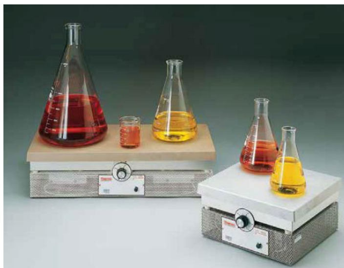
2200 Series Aluminum Top Hotplates

Alert: Recommended for use with glass vessels only