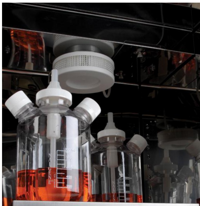
Cimarec i Biosystem Slow Speed Stirrer

Operating conditions: -10 to +56°C at 100% rH; 100-240V units contain a cord set with various plugs