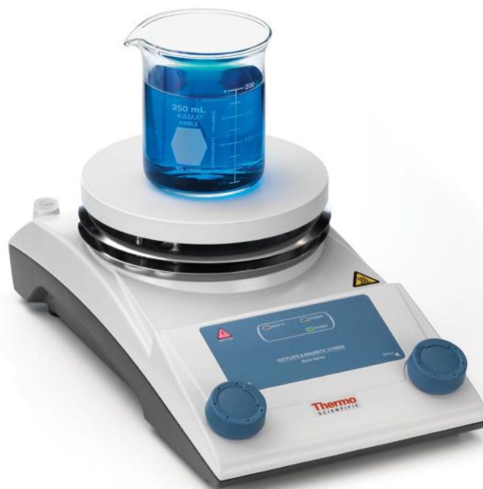
RT2 Basic Hotplate Stirrer

Optional: Non-slip heating bath, transparent shield and supporting rod