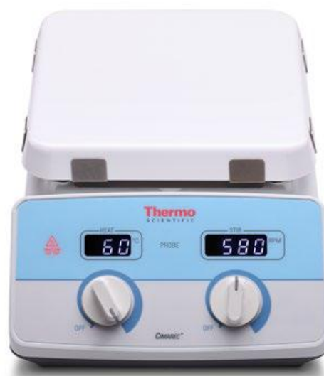
Cimarec+ Digital Stirring Hotplate

Includes: Stir bar (*only for stirrers and stirring hotplate models)