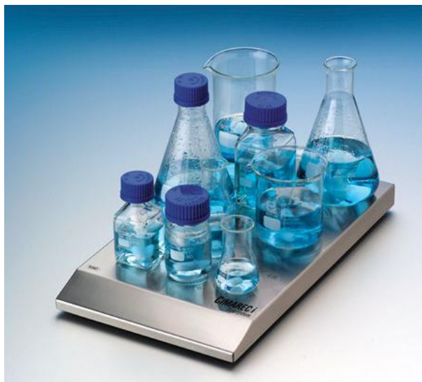
Cimarec i Telesystem Multipoint Stirrer

Operating conditions: -10° to +56°C at 100% RH in air; 0° to 50°C submerged in water. 100-240 V units contain a cord set with various plugs