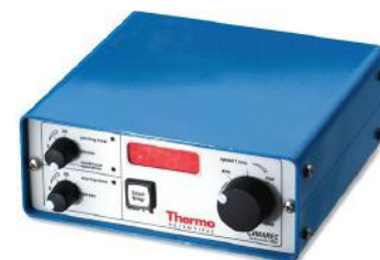
Cimarec 40M and 80M Controller