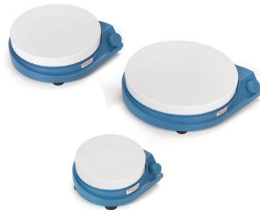
RT Basic Series Magnetic Stirrers

Certifications: cCSAus (100-120V models), CE (230V models), RoHS Compliant