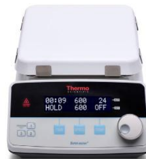
Super-Nuova+ Stirring Hotplate

Includes: PT100 Temperature probe, supporting rod and clamp kit (only for hotplates and stirring hotplates); Stir bar (only for stirrers and stirring hotplate)