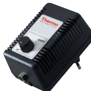
Cimarec i Standard Teleomodul Controller