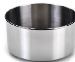
Heating Bath for RT2 Digital Hotplate