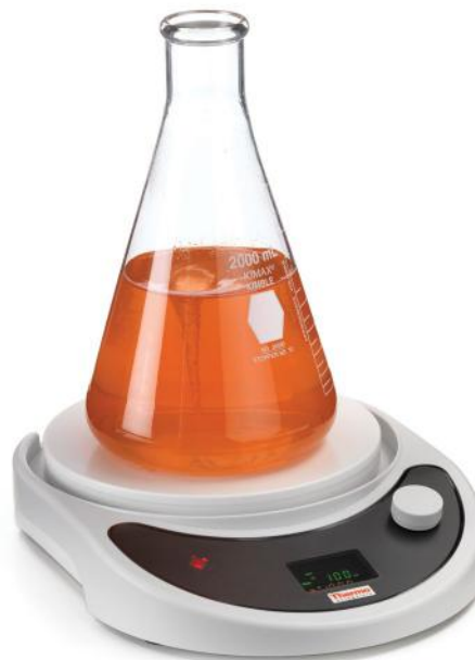
RT Touch Series Magnetic Stirrer

Includes: Stir bar and two non-slip silicone plate covers (1 black, 1 white)