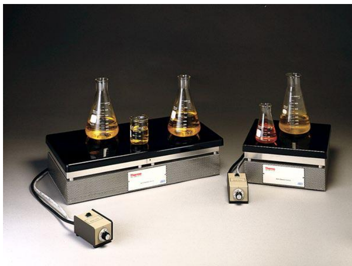
Large External-Controller Hotplates