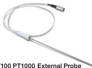
PT100 PT1000 External Probe