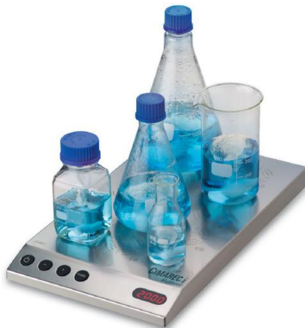
Cimarec i Multipoint 15 Stirrer

Operating conditions: -5 to +40°C at 95% rH; 100-240 V units contain a cord set with various plugs