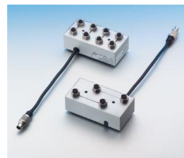
Cimarec i Benchtop Distributors