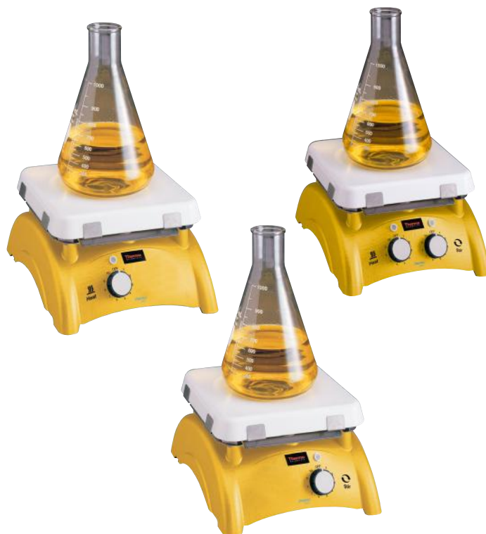
Cimarec Basic Hotplate and Stirring Hotplates