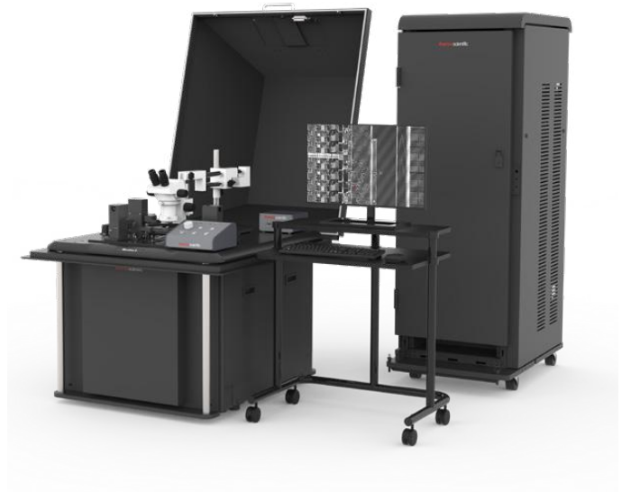
Figure 1. The Meridian S System

Packaged parts and wafer-level base-systems supported