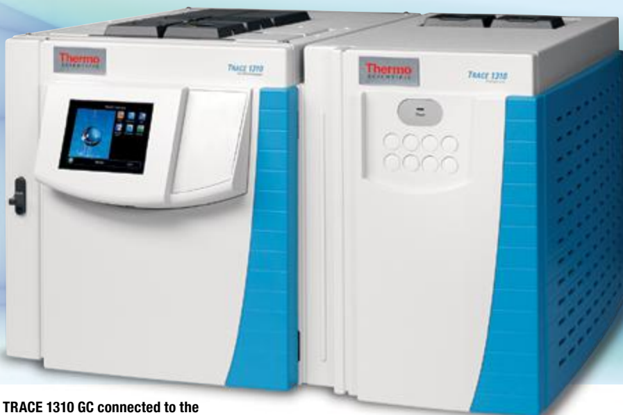
TRACE 1310 GC connected to the TRACE 1310 Auxiliary Oven