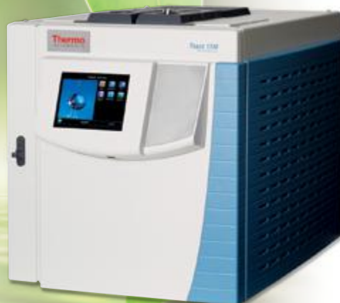
TRACE 1310 GC