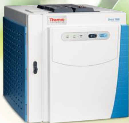
TRACE 1300 GC

This proprietary patented split/splitless injector module greatly reduces helium carrier gas consumption, using it only to supply the capillary column, while nitrogen is used for all other injection processes: inlet purge and septum, split flow and sample vaporization.