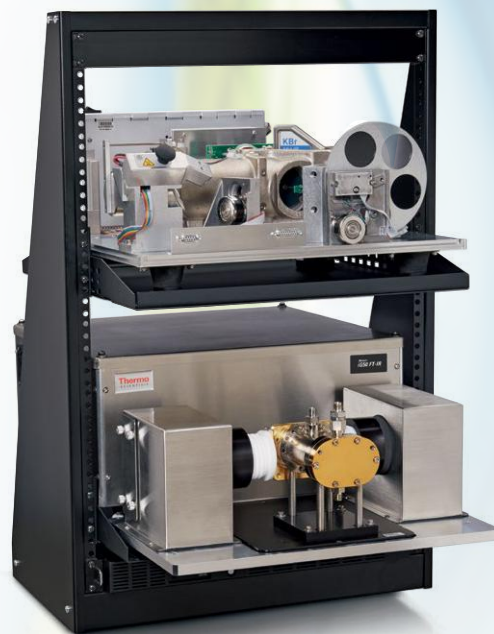
Standard sample compartment with a 2 meter gas cell in an industrial rack