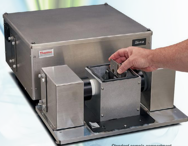
Standard sample compartment with liquid transmission cell