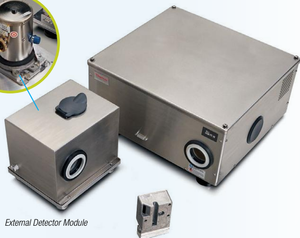
External Detector Module