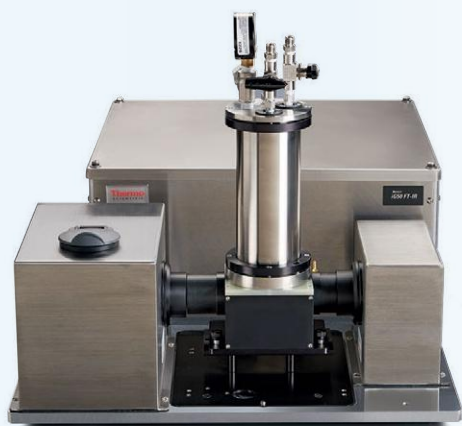
Extended sample compartment with 10 meter gas cell