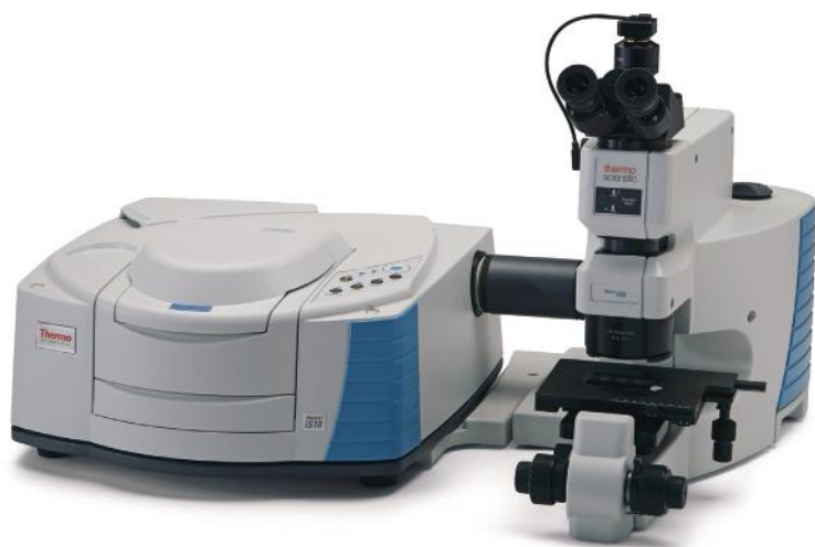
Thermo Scientific™ Nicolet™ iS™10 FTIR spectrometer with the Nicolet iN5 FTIR microscope

Find out more at www.thermofisher.com/iN5