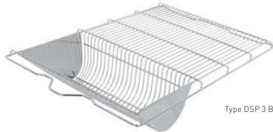
Type DSP 3 BS, 5023613