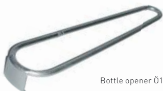
Bottle opener Ö1

Our stainless steel bottle opener makes it easier for you to remove the cap from the water bottle.