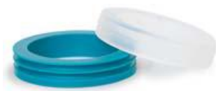
SDR 3 blue