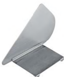
TB 2-BS divider

In order to divide the feed rack between the food and bottle.