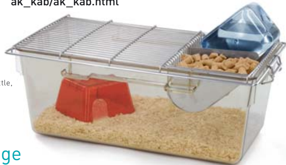
Cage type 2L with water bottle, lid and accessories

Further information is available in the brochure entitled "Cage treatment in animal husbandry" by the "AK KAB" Working Group: www.tiz-bifo.de/download/publikationen/ak_kab/ak_kab.html