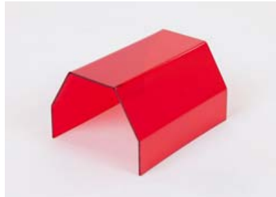
Guinea pig house