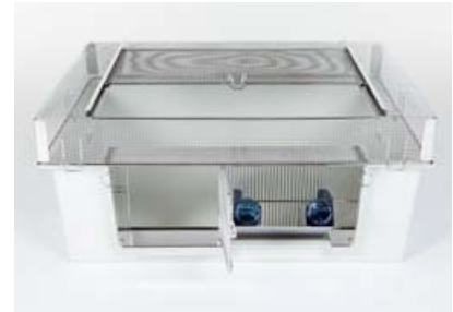
MZK 80/25L with raised cover lid for mouse and rat housing