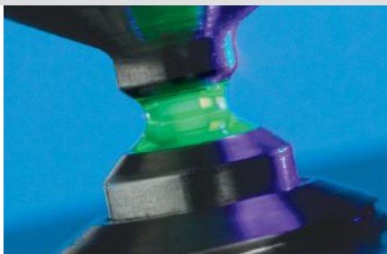
NanoDrop 3300 patented retention system

As the industry leader in micro-sample quantitation, Thermo Scientific NanoDrop products meet the needs of today's laboratory scientist with instruments that are smart, simple and robust. We combine our extensive expertise in micro-sample analysis with an in-depth understanding of real-life applications to deliver the latest in UV-Vis and Fluorescence instrumentation.