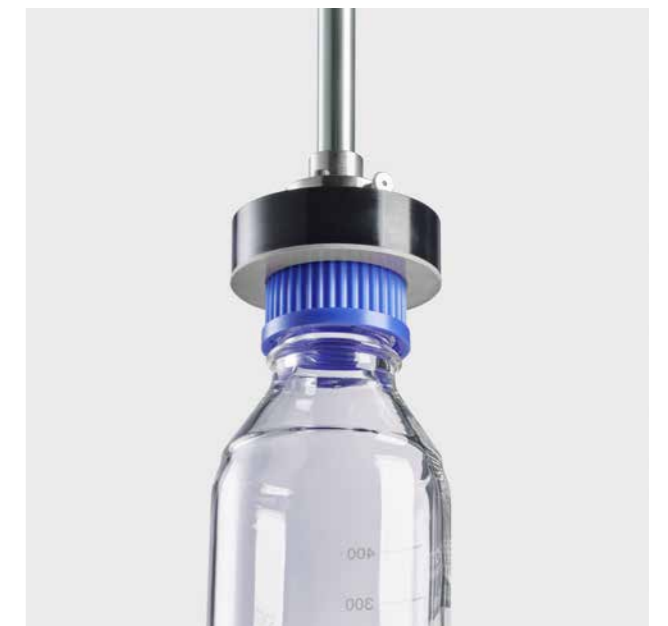
Universal membrane adapter – for caps with a flat top

Molded cap adapters that are custom-made to the specific shape of a cap eliminate additional pressure typically caused by clamping or other cap fixtures. Alternatively, universal membrane cap adapters can be utilized for caps with a flat top – minimizing the necessary number of adapters.