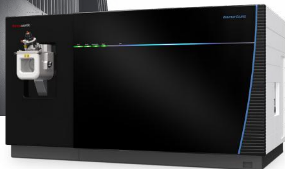
Orbitrap Eclipse Tribrid Mass Spectrometer