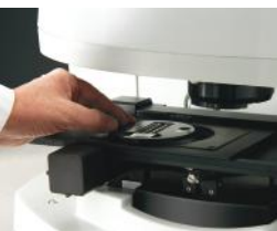
Eject button and Slide-View of OMNIC Picta allow simple and fast sample loading