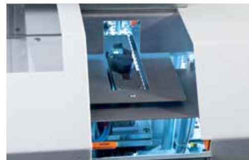
Simple and safe sample input is guaranteed by an automated locking device