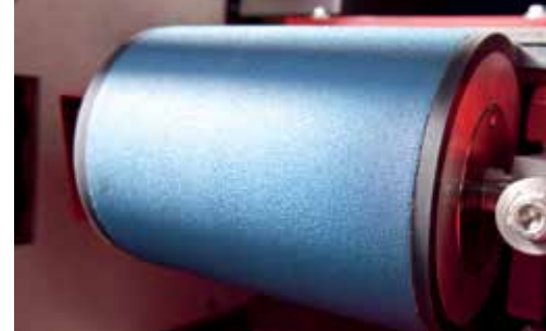
Optimized machine exploitation by integration of the cup wheel and abrasive belt: in combination or separately