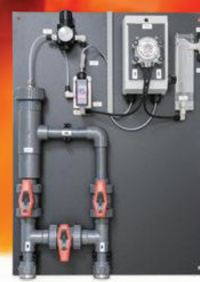
Sample Preconditioning Panel