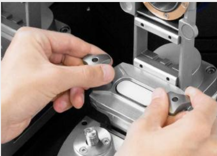
INSERTING THE GRINDING JAR