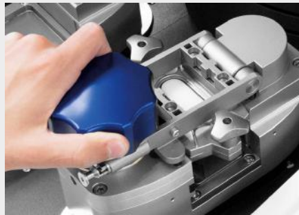
CLOSING THE JAR CLAMP