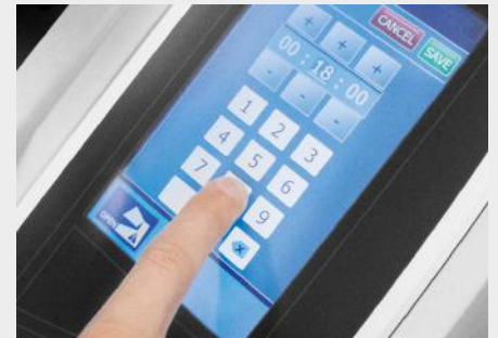
OPERATING THE TOUCHSCREEN