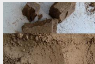
cocoa filter cake